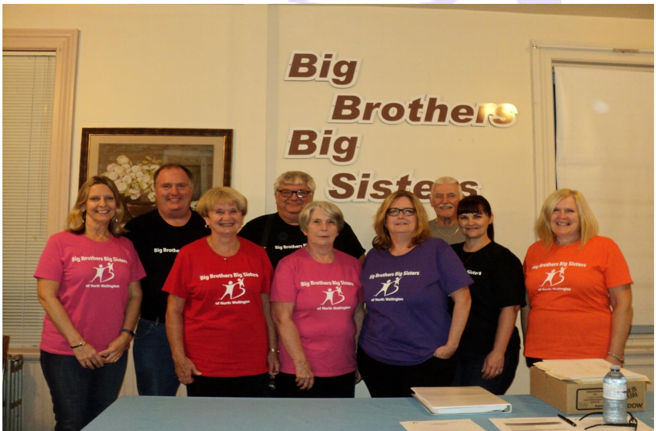
Absent from Photo: Beth Haines